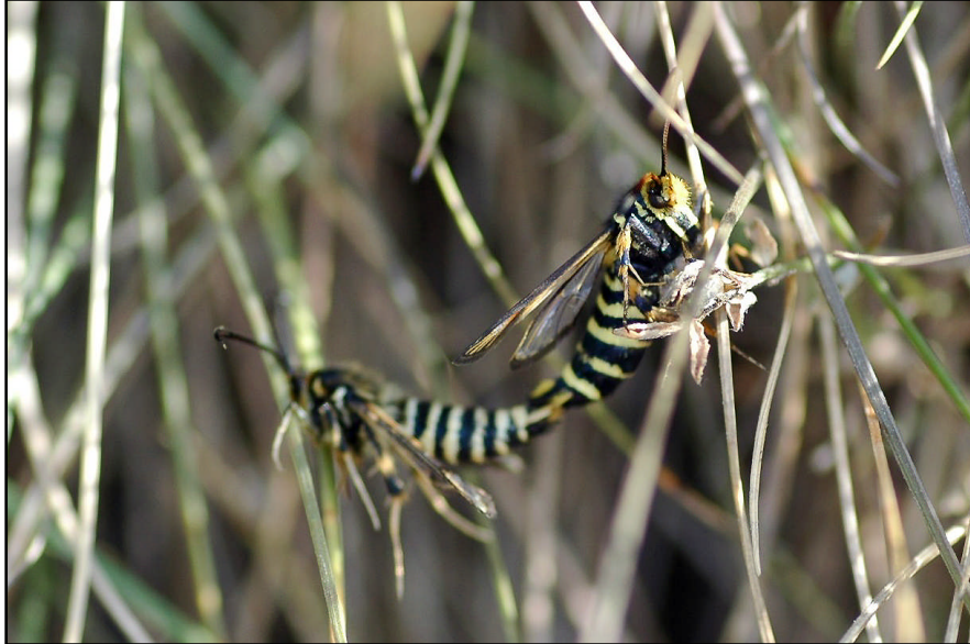
Six-belted Clearwing ( Bembecia ichneumoniformis ), Talland Bay, 25th July 2006.

I managed to take a couple of record shots, one of the female and one of the pair, but they soon disappeared from the scene. It was the first time I had managed to find this species without the use of a pheromone lure.”