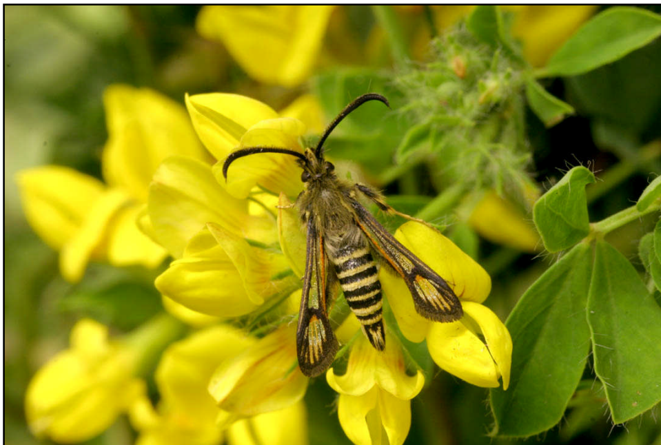
Six-belted Clearwing - Bembecia ichneumoniformis (D&S) Spit Beach, Par, Cornwall - 21st July 2005.