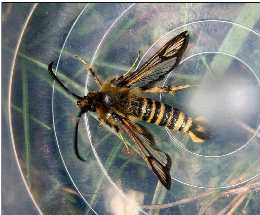
Six-belted Clearwing - Bembecia ichneumoniformis (D&S) Gear Sands, Perranporth, Cornwall - 9th July 2005.